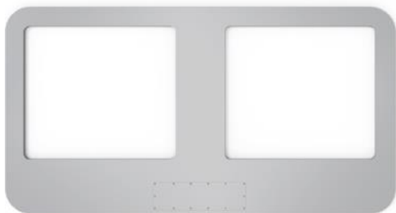
Saturn Floor Antenna

AM floor antenna Saturn G80 has improved performance and secures stores with a detection height of up to 1.5m (4.9ft). The invisible floor antenna enhances high security and maximizes customer flow in the stores